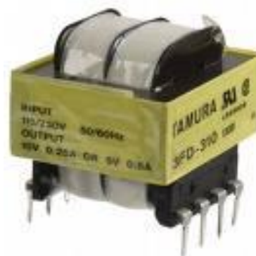
PCB Mounted Power Transformers

Contact: Tqdgt vMgk "Renewable Energy Components: tmglpB r kmr qv gt @eqo